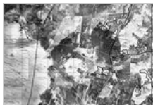
The Location of IIBR and the roads leading to it.

The story can now be told, thanks to the International Committee of the Red Cross (ICRC) files which have now become available, 50 years after the event. A series of reports, under the reference G59/1/GC, G3/82, sent by ICRC delegate de Meuron from 6 May to about 19 May 1948 describe the conditions of the city population, struck by a sudden typhoid epidemic, and the efforts to combat it.