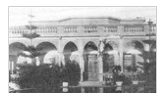
Photograph of the Shukri Al-Taji Mansion which became IIBR, the centre of biological terrorism.